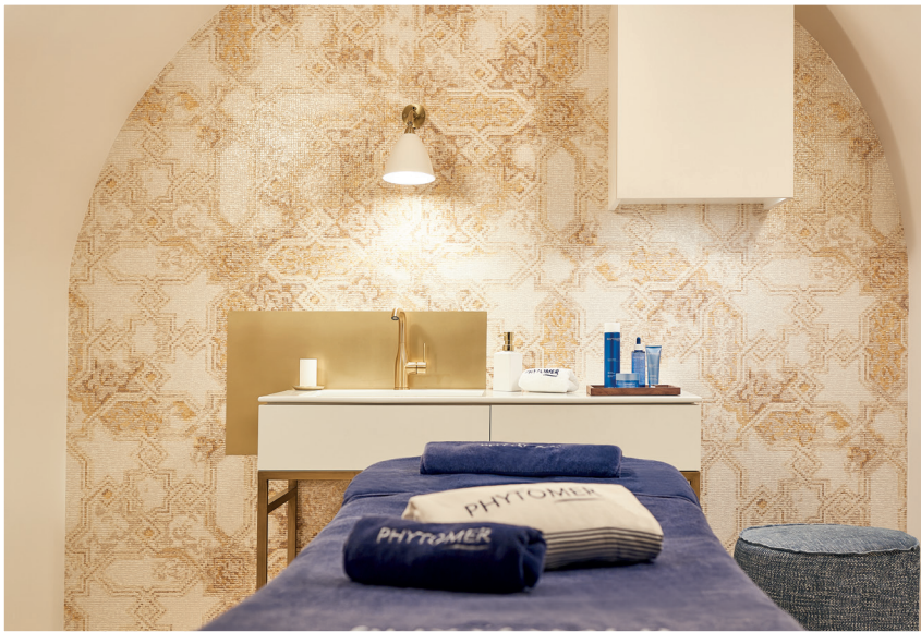
Étoile Phytomer Spa

In the comfort and intimacy of our spa, let yourself be carried away by a wave of well-being. It's an opportunity to recharge, take a well-deserved break, and offer your loved ones a precious moment of relaxation.